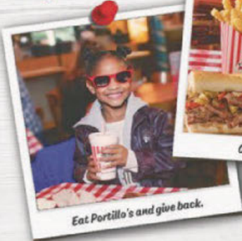
Eat Portillo's and give back.