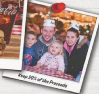
Keep 20% of the Proceeds

Join us at Portillo's for a fundraiser to support: