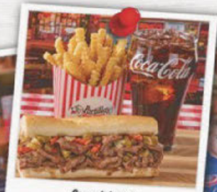
Come join us!